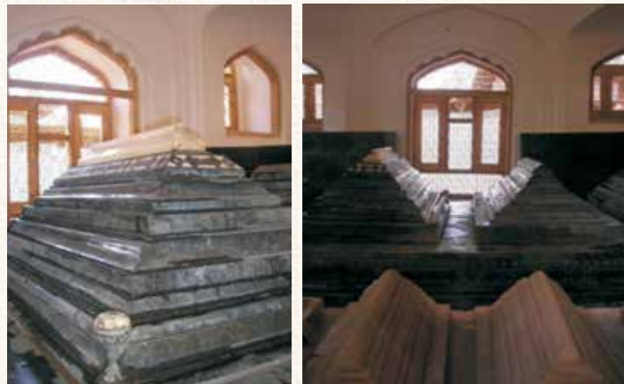
Interiors of the Thag Baba Shrine, J & K Chapter – after restoration