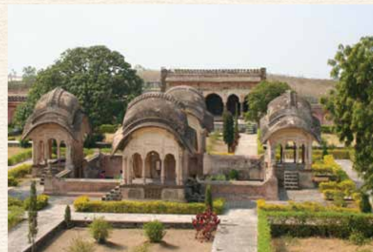
Conservation of Surangabad by Aurangabad Chapter

INTACH in 30 years has built a firm and stable foundation. This was primarily achieved on account of the immense work undertaken by the INTACH network of Chapters, which forms the backbone of the Organization. Each of the Chapters has initiated a number of exemplary works.