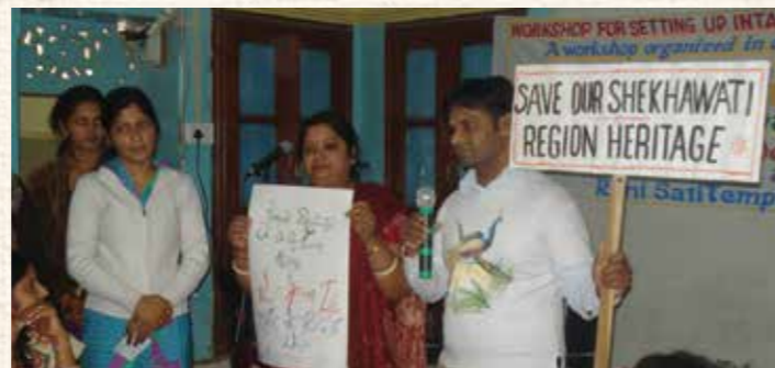
Teacher training workshop, Jhunjhunu, Rajasthan

INTACH's mission to conserve heritage is based on the belief that living in harmony with heritage enhances the quality of life, and it is the duty of every citizen of India as laid down in the Constitution of India.