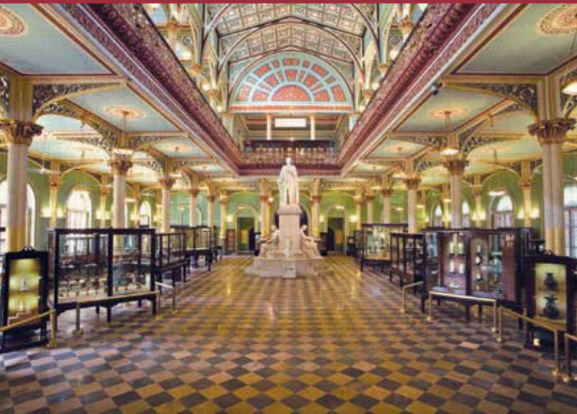
Award of Excellence. UNESCO Asia Pacific Heritage Award. Dr. Bhau Daji Lad Museum, Mumbai.

INTACH IS A MEMBERSHIP ORGANIZATION of volunteers, and functions on the strength of its members who are affiliated to a Chapter. Chapters are Forums formed with about 25 Members. A Chapter has a Convener and a Co-Convener appointed by the Central office. The Chapter can adopt a flexible approach in its internal structuring as long it does not dilute its legal and financial accountability. It has an Executive Committee and constitutes sub committee's to co-ordinate it's working. A State Convener is also appointed, who is essentially one of the links between the INTACH Central Office and the Chapters in the State.