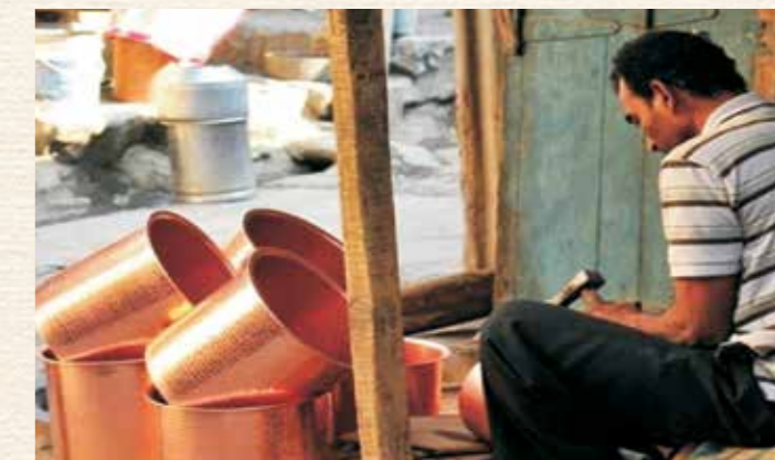
Pune Chapter — Copper crafts people