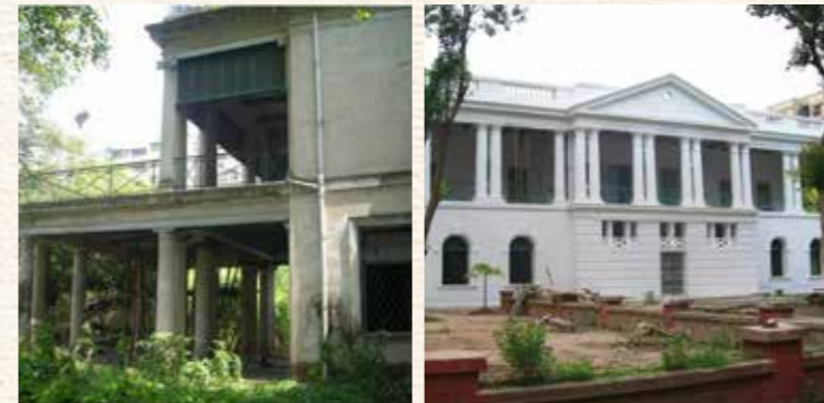
Royal Club, Russel Street, Calcutta - before and after conservation

INTACH in 30 years has built a firm and stable foundation. This was primarily achieved on account of the immense work undertaken by the INTACH network of Chapters, which forms the backbone of the Organization. Each of the Chapters has initiated a number of exemplary works.