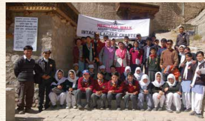
Heritage Walk in Old Leh town